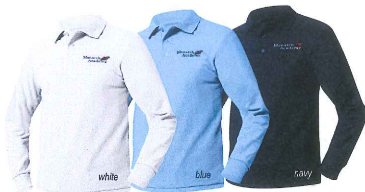
Long Sleeve Knit Polo Shirts w/logo