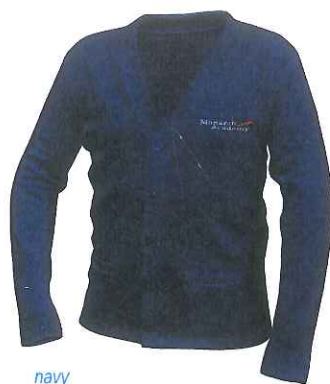
V-neck Sweater Cardigan w/logo