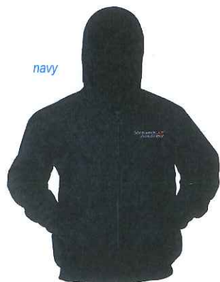
Zip-up Hooded Sweatshirt w/logo