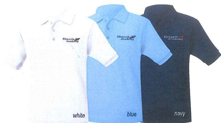
Short Sleeve Knit Polo Shirts w/logo *Option for Grades 6-8.

Burwood Village Center 1608 W. Furnace Branch Road Glen Burnie, MD 21061 410.684.2816