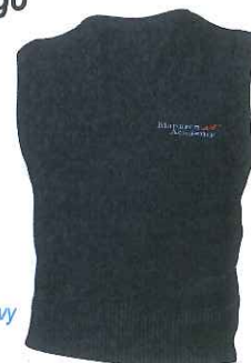
V-neck Sweater Vest w/logo