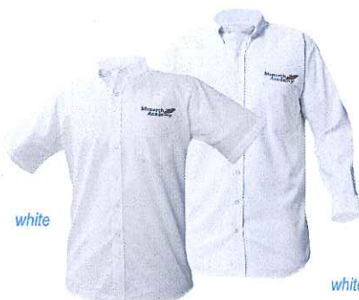
Button-down Collar Blouse w/logo